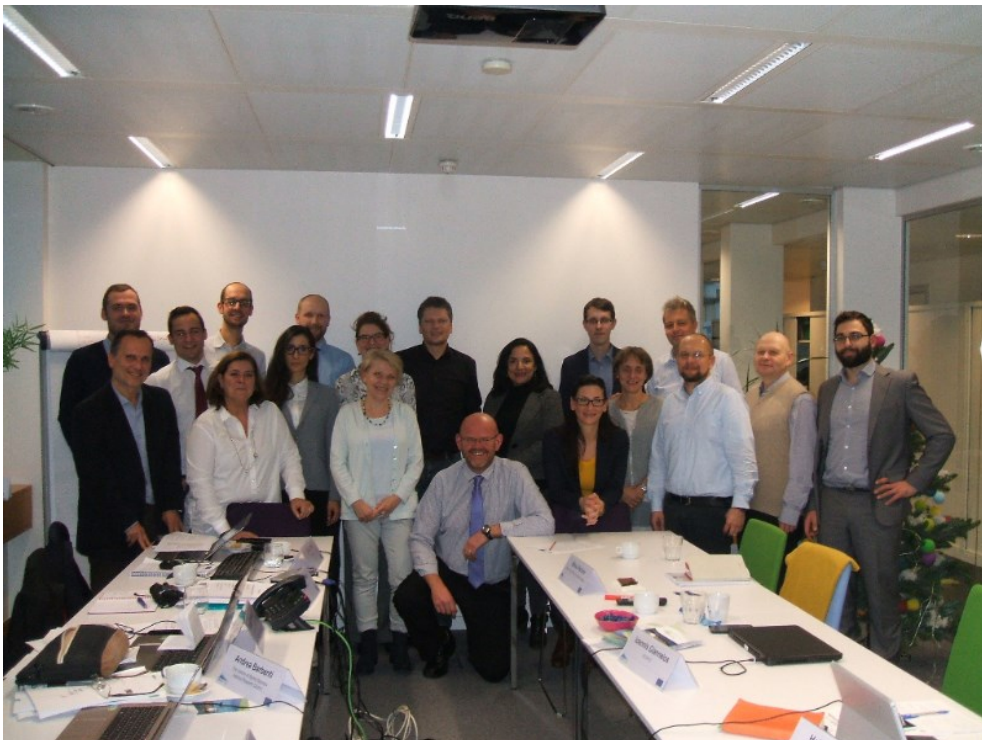
The MUSES Consortium

MUSES had its kick-off meeting in December 2016 in Brussels. This was the very first time that the consortium had met face-to-face since the planning for the project began over a year previously. Hosted by Ecorys at their premises within the European Quarter of Brussels, the meeting not only allowed partners to finally put names to faces, but each partner also provided an overview of their involvement within the MUSES project going forward. There was also the chance to review in detail the work to be undertaken within each work package and discuss the best methods for doing so. Also attending on the first day were representatives from the European Commission and the Innovation and Networks Executive Agency.